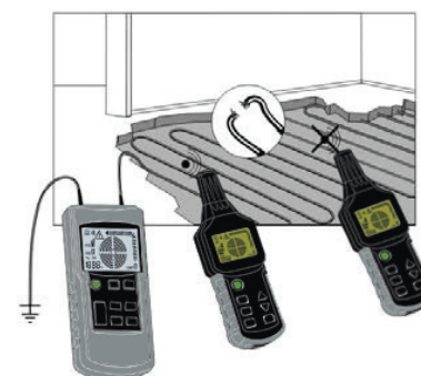
Detects breakers in radiant heating systems